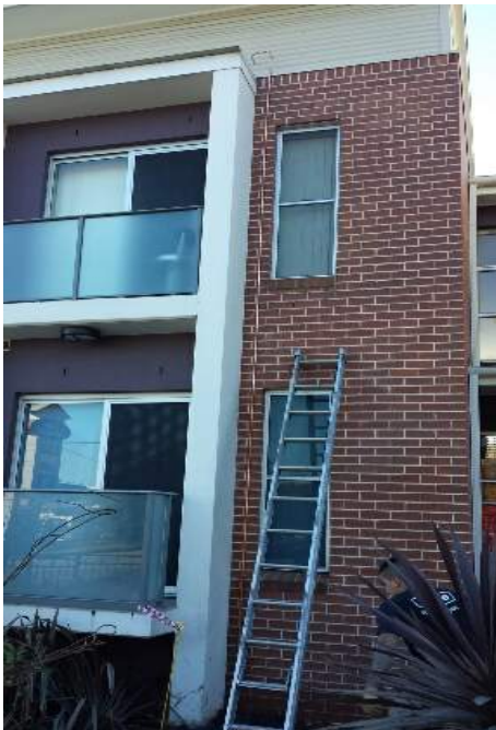
Located leak coming from under the building in the unit 7 line - we redirected entire copper line going up on the external wall and reconnected to unit 7 roof space as the building was sitting on floor slab