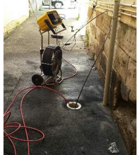
Conducting high pressure drain cleaning and CCTV camera inspection