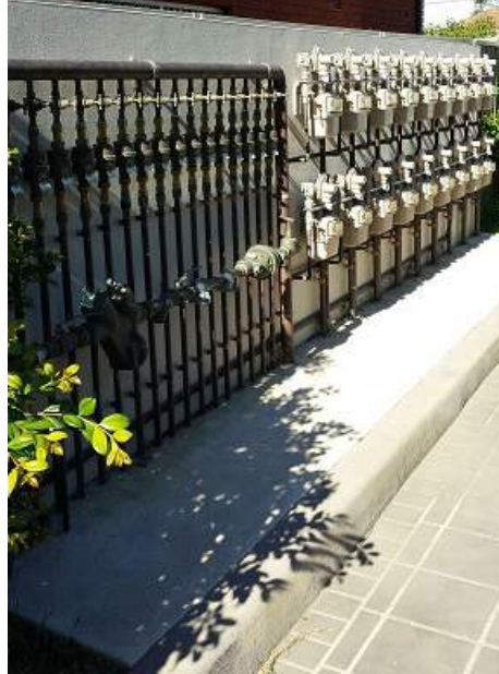
Residential meter installations