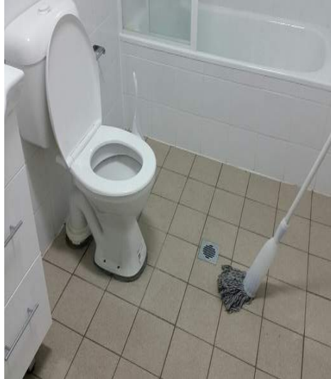
Always cleaning up upon Completion