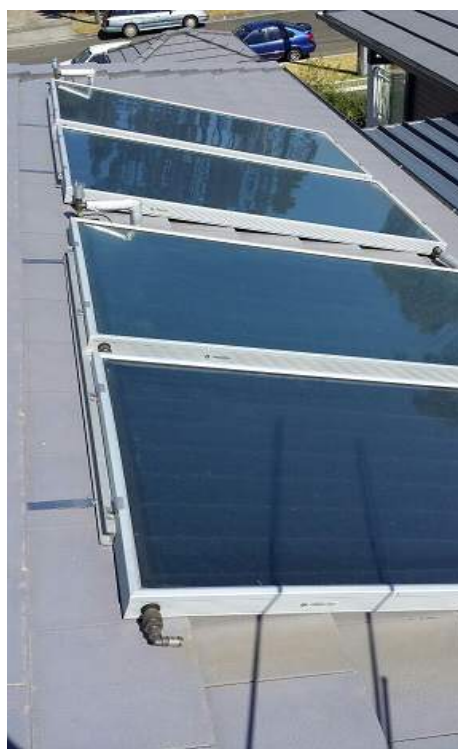
Solar installations, repairs, and fault finding