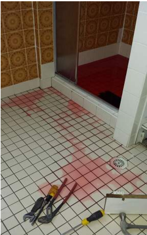
Carrying out Pressure and Dye Test for units and houses to locate leaks through walls causing moisture problems