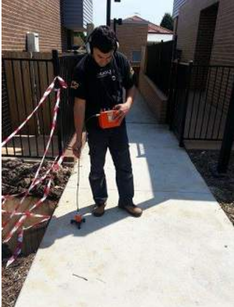
Leak detecting using the latest leak detection devices and pipe locating