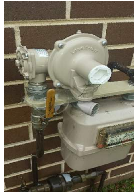
Gas leak detection for all buildings