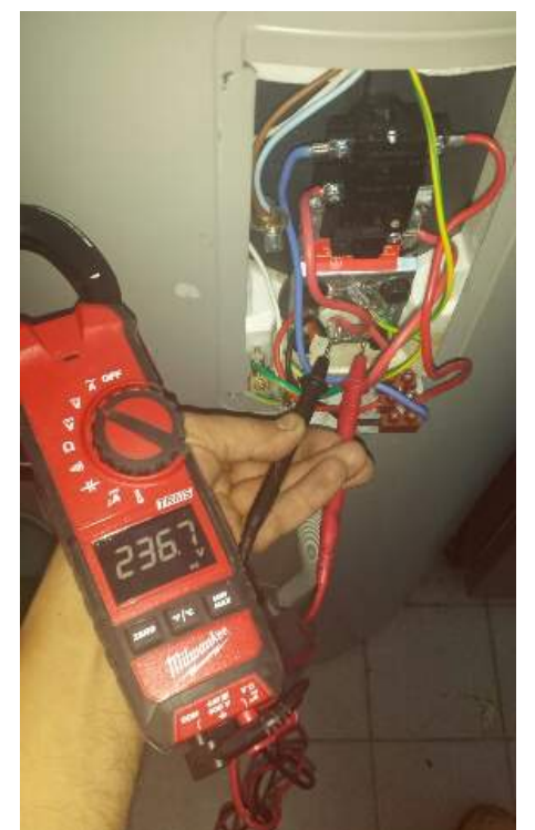
Heat pump hot water unit installations and repairs