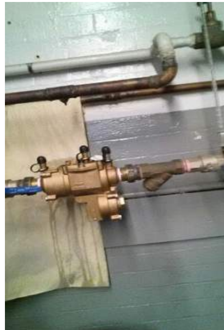
RPZ installations and annual testing for commercial and residential high rise buildings