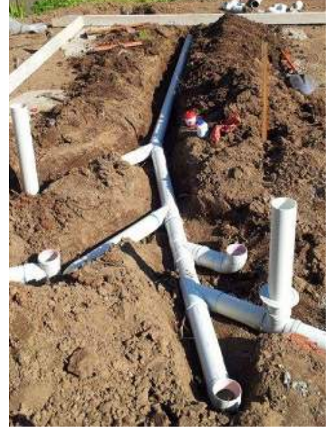
Internal drainage layout for domestic